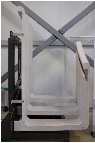
Post tension staircase model